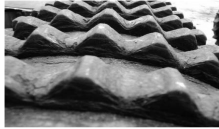
Fig. 4 shows the worn out feed roller.

the corrosion resistance. Fig. 4 shows the worn out feed roller.