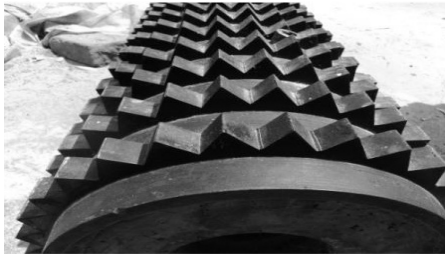
Fig. 2 New feed roller.

the corrosion resistance. Fig.2 shows the new feed roller.