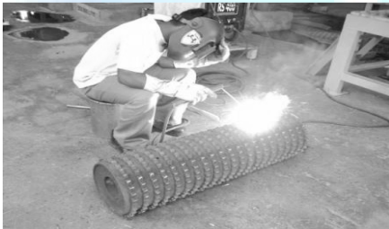
Fig.3 Hardfacing procedure.

Metal arc welding is used for hardfacing on the surface of substrate. For hardfacing of substrate the MAGNA 402 and MAGNA 403 hardfacing electrodes are used. Fig. 3 shows the hardfacing procedure done on feed roller. Fig. 4 shows the hardfacing process carried out in worn out feed roller.